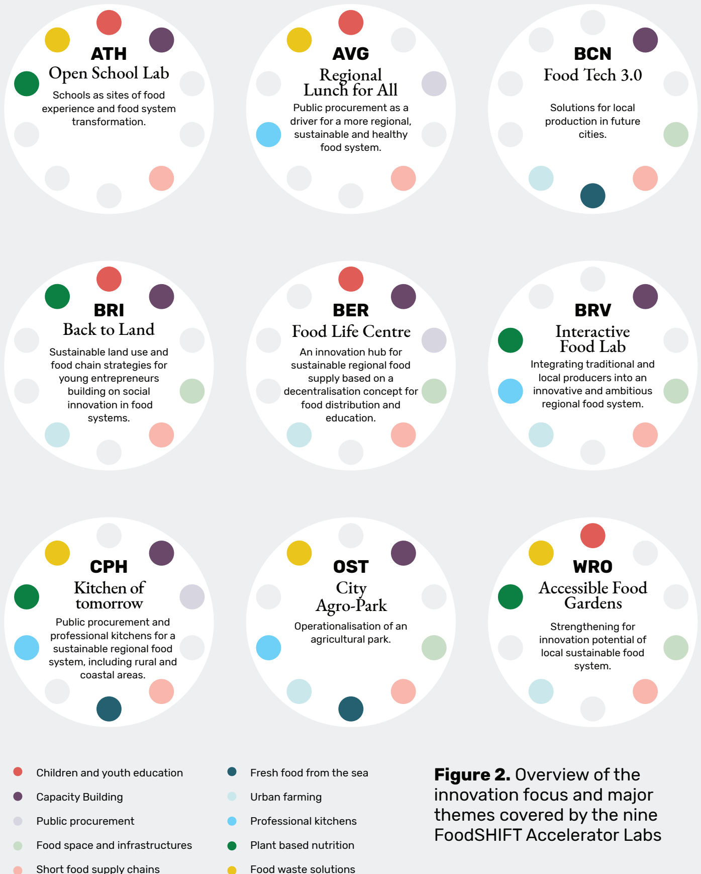
Figure 2. Overview of the innovation focus and major themes covered by the nine FoodSHIFT Accelerator Labs